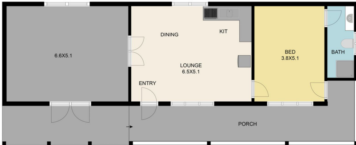
GRANNY FLAT (NOT IN POSITION)